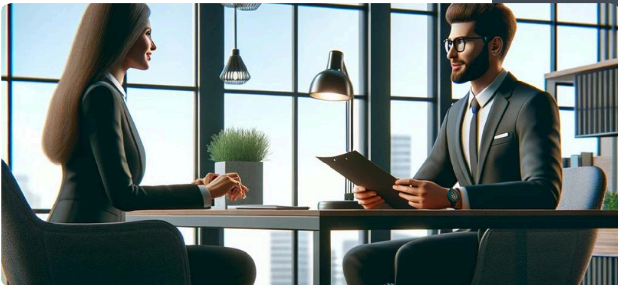
Image created by AI for this guide

Copilot can assist HR teams in recruitment by drafting job descriptions and adverts, screening CVs, scheduling interviews, and providing insights into the job market. It can also help identify the best channels for sourcing candidates.